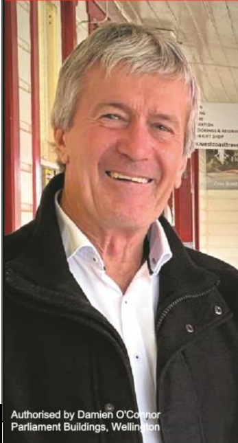
Authorised by Damien O'Connor Parliament Buildings, Wellington