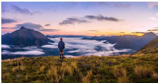
Above tarn camp at dawn, looking northeast, with Mt Kendall left and Mt Luna right

They had to go quite a way down the track before the river was deep enough to launch their rafts after the Taipo Hut on